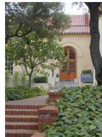
Drama Department and Prosser Studio Entrance

Memorial Auditorium is Stanford's largest performance facility, seating just under 2000. The entrance to the theater faces Hoover Tower and the fountain.